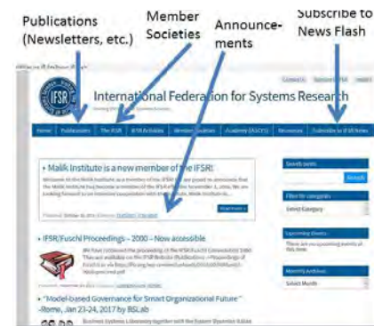
Abbildung 7: IFSR Homepage 2018

<GC> reports: The homepage (see "ifsr.org") has been refurbished by Christian Waltner (www.waltner-webdesign.at) and has now a much better outer appearance. Unfortunately only few members use it as a communication medium to the systems community.