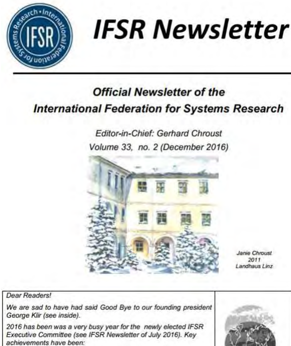
Abbildung 5: IFSR Newsletter no. 33-2 (Dec. 2017)

tabled: Newsletter 2017 (2 issues) <GC> reports that the Newsletter is usually published twice a year and put on IFSR's Website. For documentation and legal purposes approx. 12 copies are printed, the rest is mailed and offered electronically.